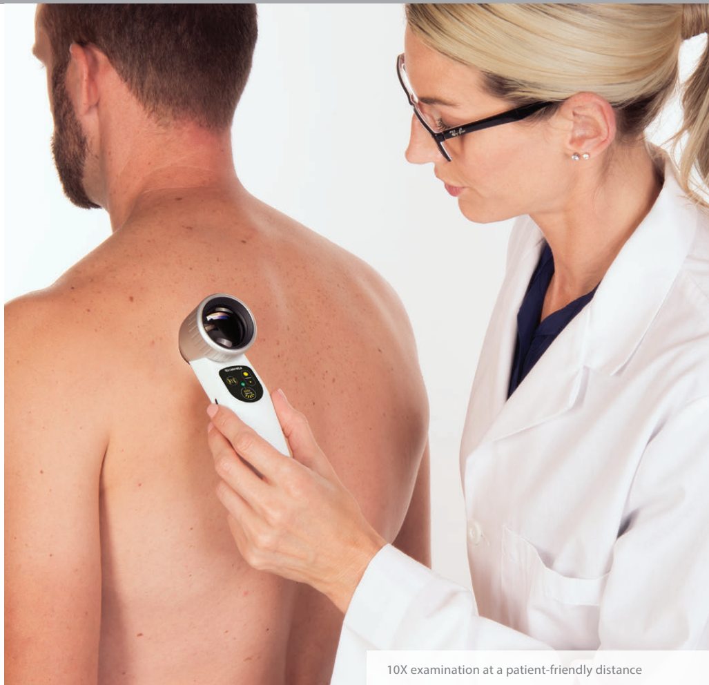
10X examination at a patient-friendly distance

The microprocessor-controlled light mixture of Luminis allows color reproduction close to natural daylight.